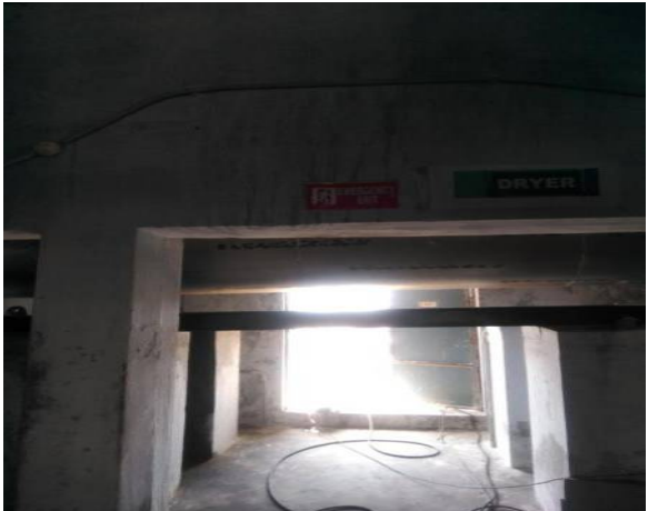
Pictures 10 and 11: Inoperable Fire hydrant with rusted handle and fire exit obstructed with pipes (Vaigai Industries)

M/s Vaigai Industries - The fire exit was blocked and one of the hydrants was inoperable with rusted handle ( Pictures 10 and 11 ) and hose reel, wet riser system, automatic sprinkler system, electric fire alarm, exclusive terrace and underground water tanks with 170 kilo litre capacity were also not available.