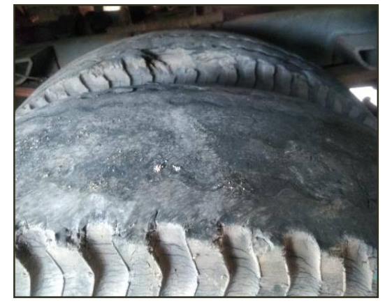
Picture 3: Intense water leakage, Karaikal fire engine Picture 4: Poor tyre condition, Bahour fire engine